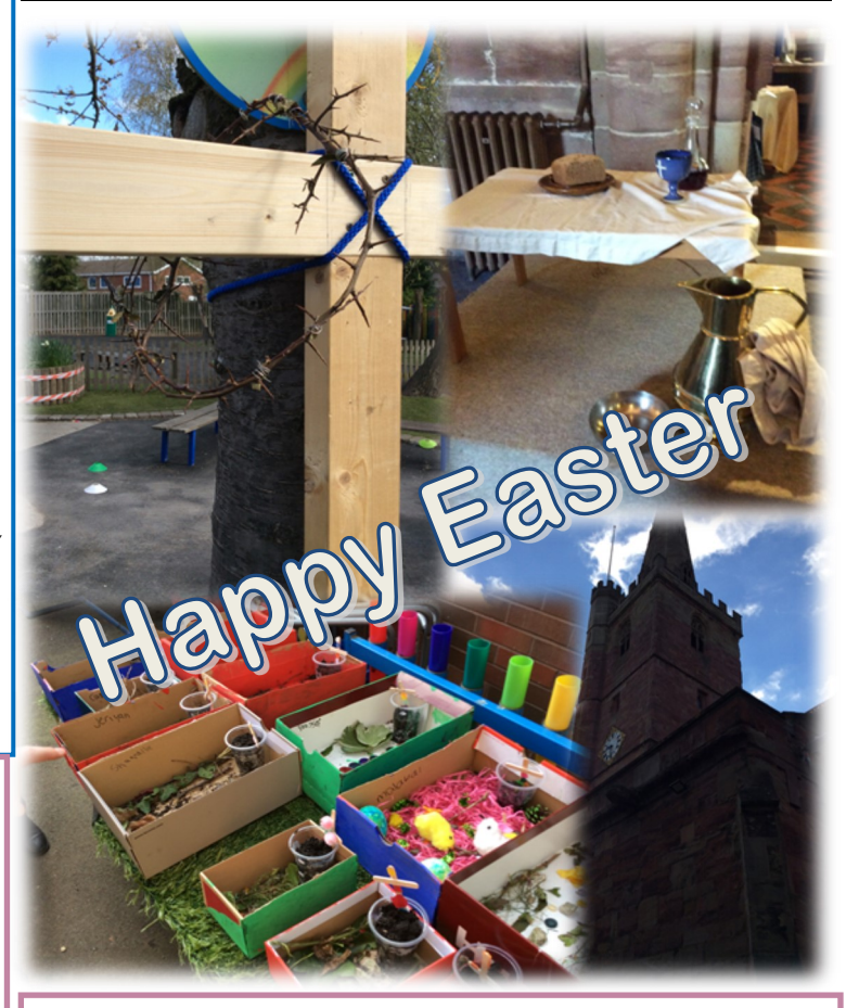
Photos are from our Easter Pilgrimage. The Easter gardens were made by our Nursery Children